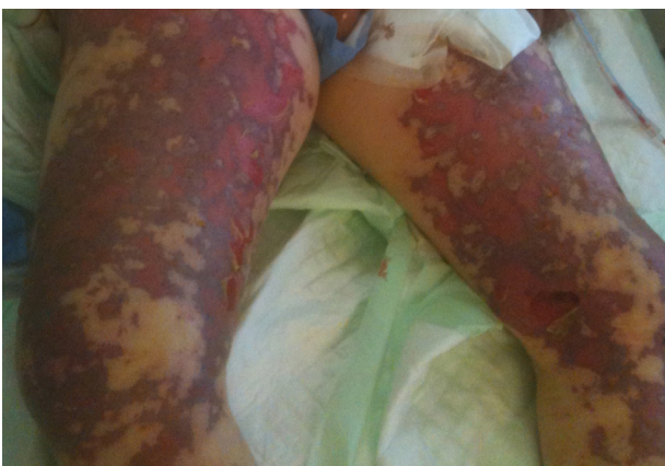
Figure 1. Splenectomized patient presenting with purpura fulminans due to OPSI.

It is difficult to estimate the incidence of OPSI, since most studies have been retrospective with variable monitoring periods, variable definitions [7], and were published before the advent of conjugate vaccines against Pneumococcus , Hemophilus , and Neisseria species [16]. A large 2001 literature review by Bisharat et al. that included 19,680 patients